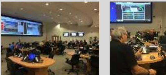
AS360 – Command Staff Tabletop for public safety hosted at county Emergency Operations Center.

Proprietary Custom SIM technology for advanced training opportunities: